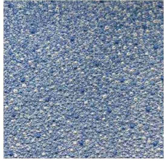
Touch from Above (monochrome blue), 2020, mixed media on wood panel, 48 x 48 inches