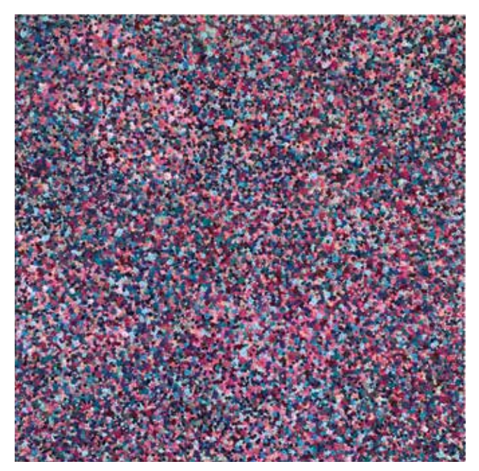
Touch from Above (pink turquoise), 2020, mixed media on wood panel, 48 x 48 inches

Gianna's work has been exhibited locally, nationally and internationally, in both group and solo exhibitions, art fairs and in public places.